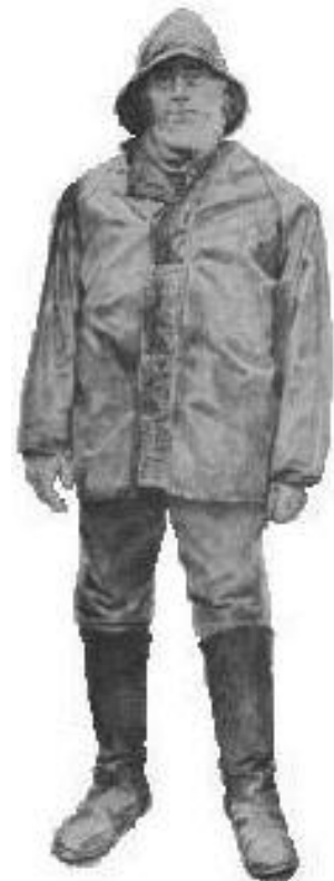
Drawing by Christian Krogh

The poem Terje Vigen was probably written in 1861, many years after Henrik Ibsen left Grimstad, and the poem was published in 1862. Henrik Ibsen said that there were "many persons like Terje Vigen" at the coasts, and thereby pointed out that Terje Vigen first of all is a poem and not a biography.