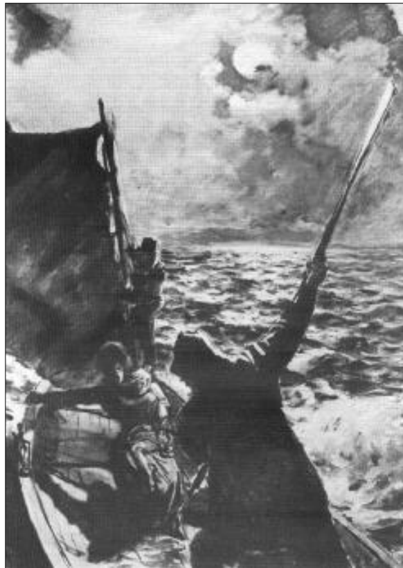
Drawing by Christian Krogh

The poem "Terje Vigen" is the dramatic saga of the Norse pilot from Grimstad, Norway, who tried to run through the English blockade of the Norwegian coasts during the Napoleonic Wars in 1807-14, to smuggle food from Denmark back to his starving family.